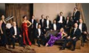
Pink Martini (July 3)