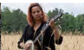
Rhiannon Giddens (July 24)