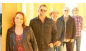
The SteelDrivers (July 26)